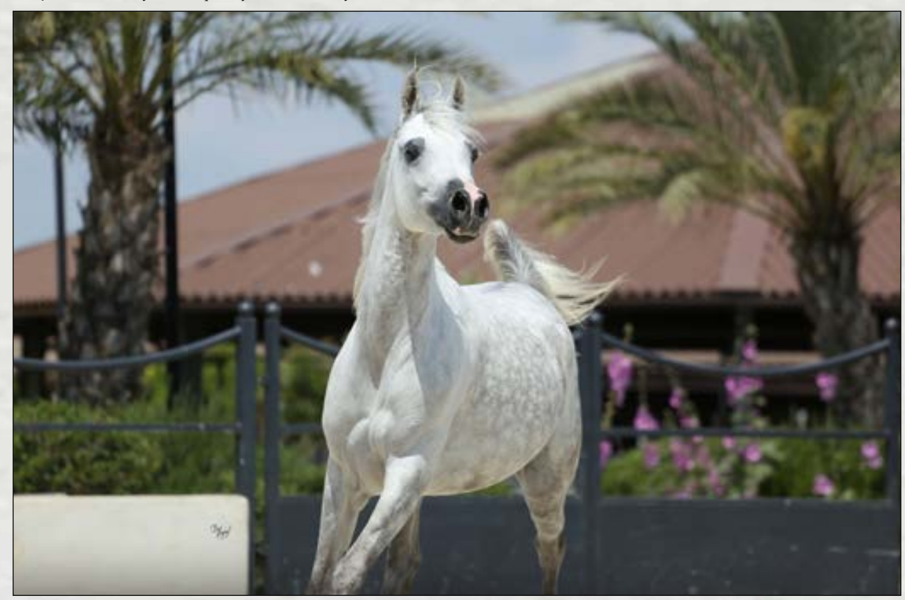
Balqis AA (Laheeb x Al Baraqai AA).