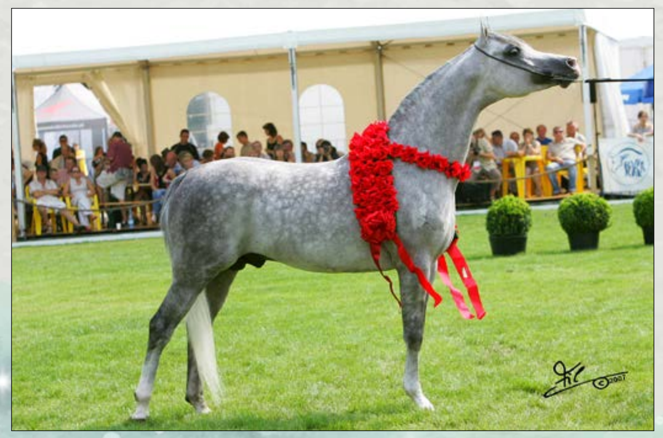
Multi Champion Stallion and Polish National Champion Poganin (Laheeb x Pohulanka).