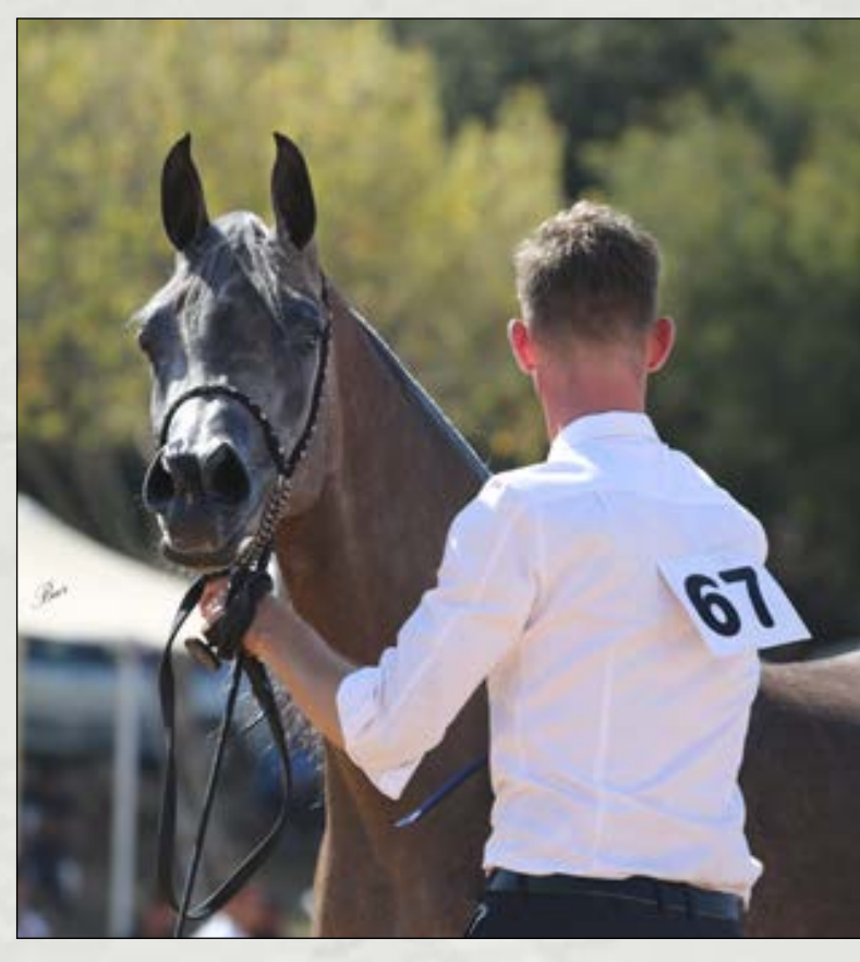
Multi Champion Mare Salsabil AA (Laheeb x Saniyyah RCA).