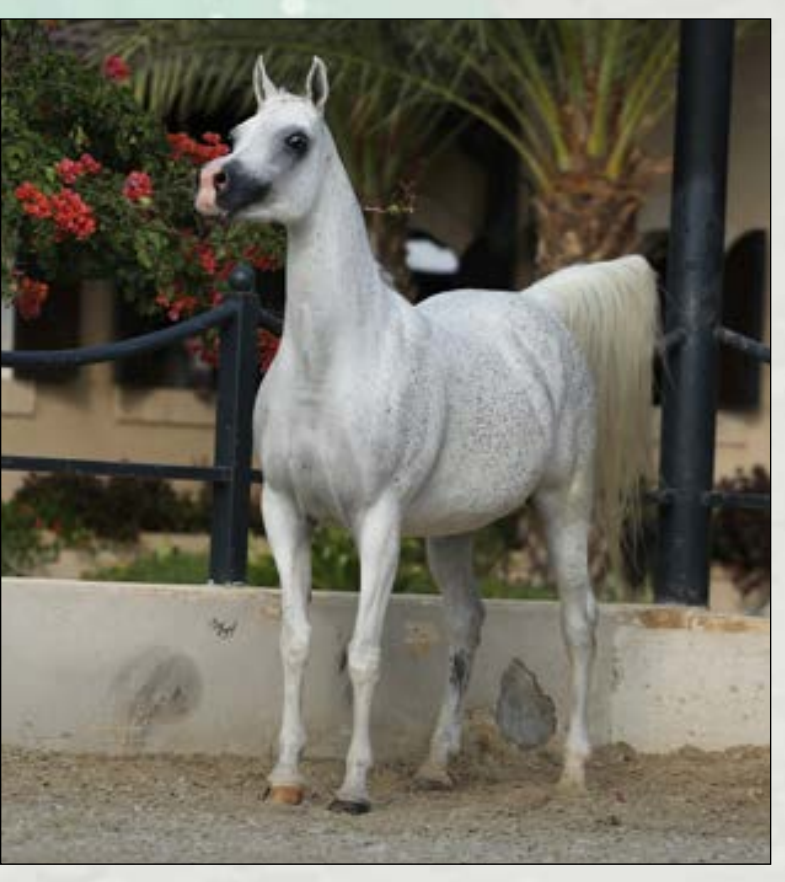
Badriyah AA (Nader Al Jamal x Baraaqa AA by Laheeb).