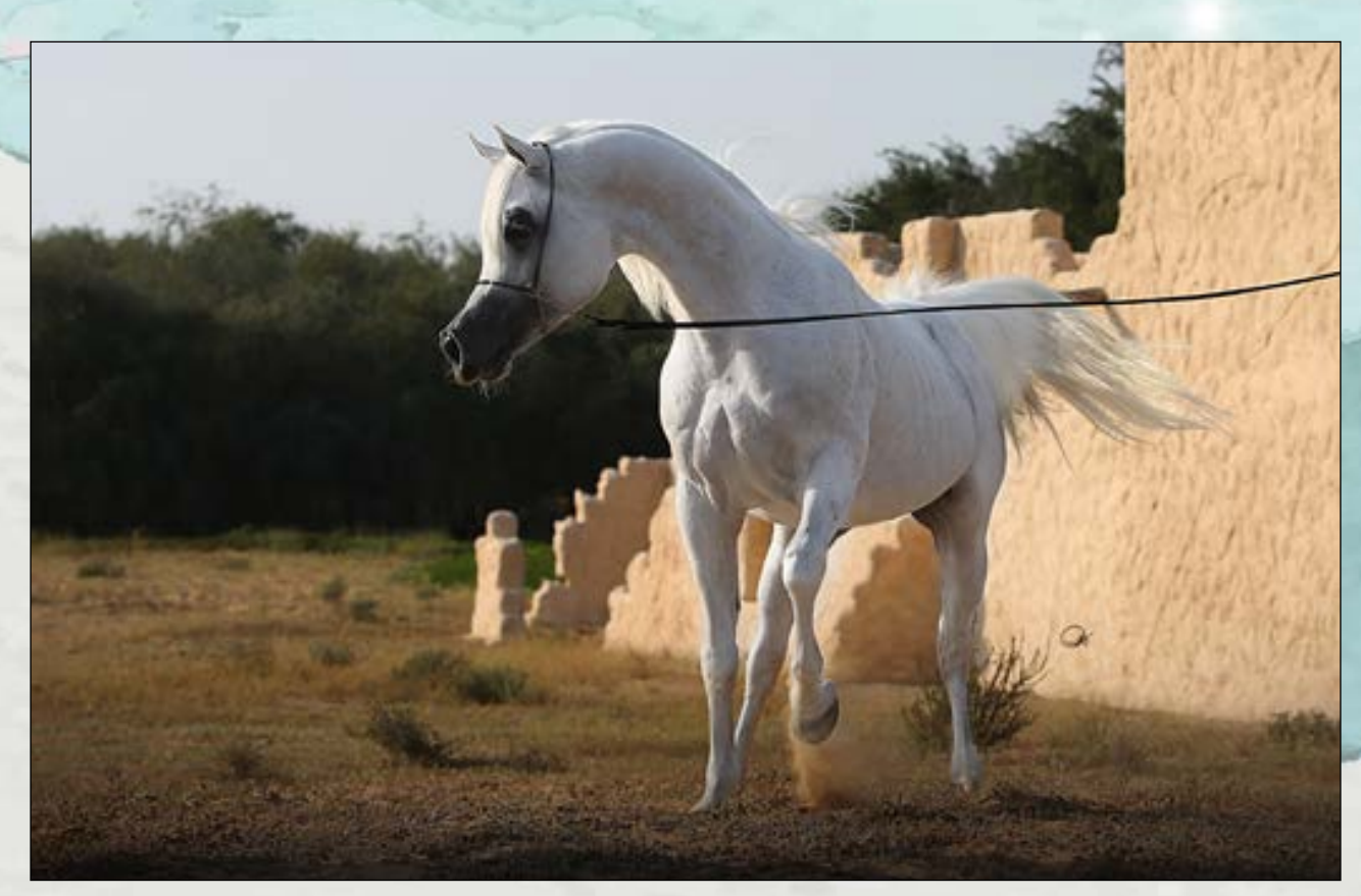
Multi Champion and 2006 World Champion Stallion Al Lahab (Laheeb x The Vision HG).