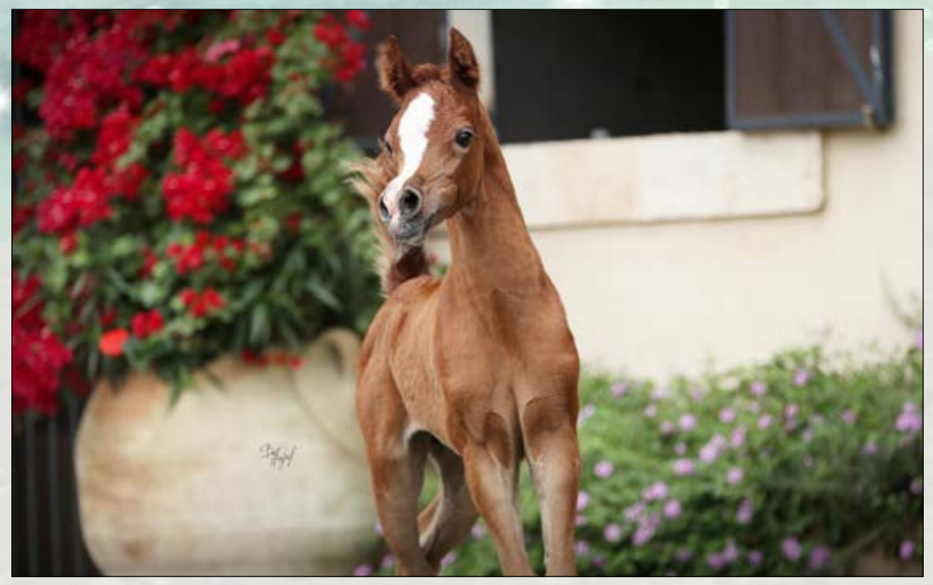
Nasmah <sup>AA</sup> (Moaiz Al Baydaa x Nefertiti <sup>AA</sup> by Laheeb).