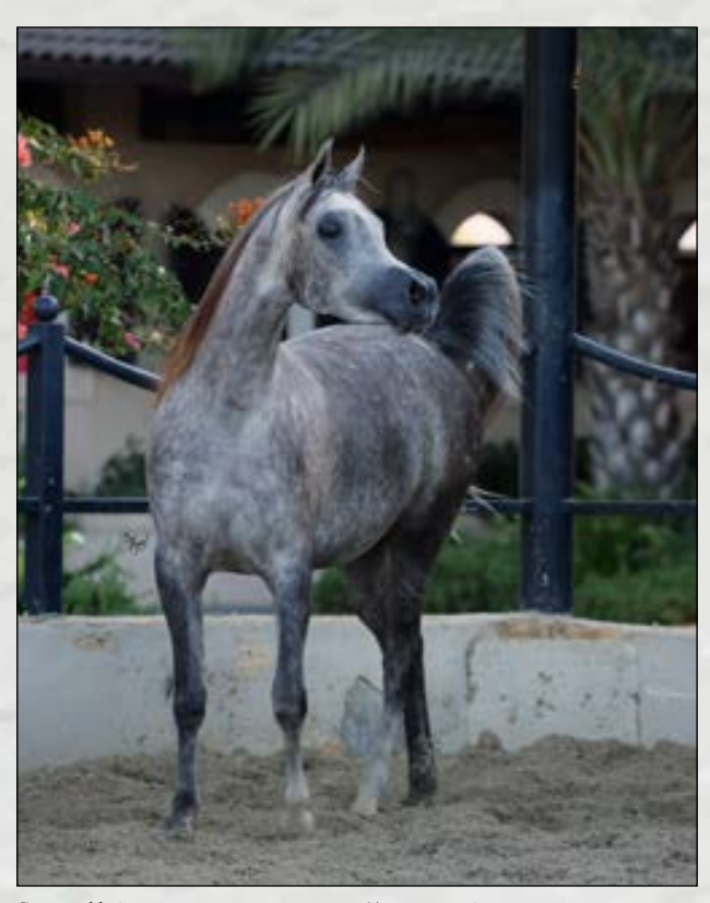
Sinaya AA (Frasera Mashar x Safiyyah AA by Laheeb).