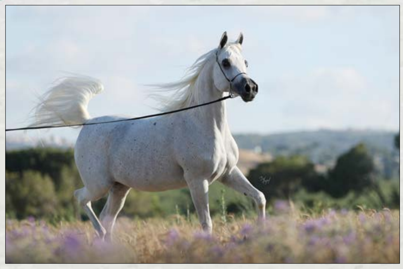
Multi Champion Mare Dafina AA (Al Bilal x Dumka by Laheeb).