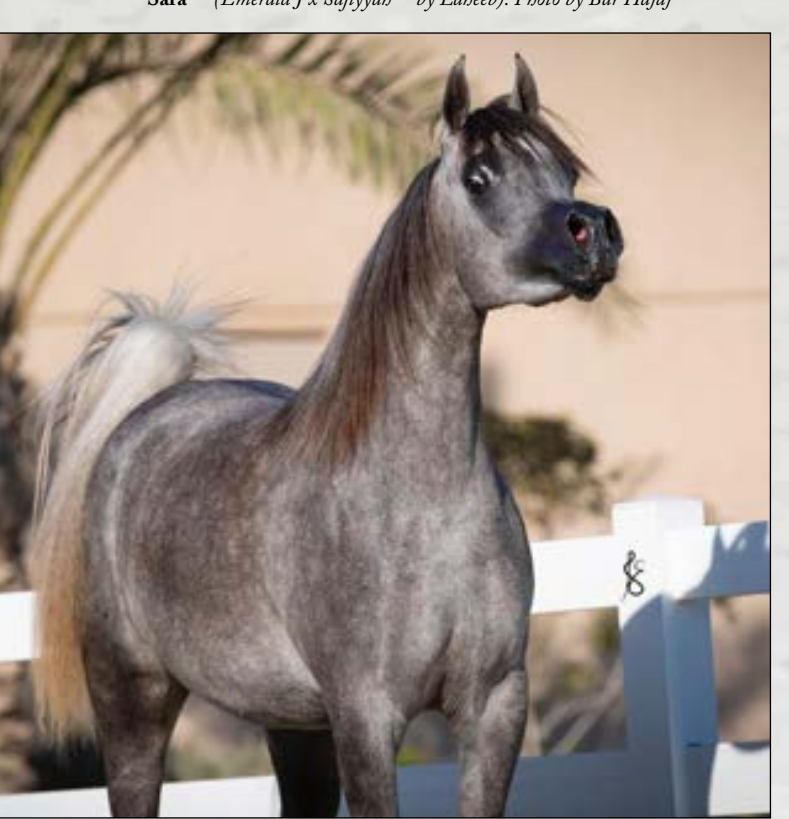
2018 Gold Champion Yearling Filly at the All Nationals Cup International Egyptian Event in Kuwait, Bosmat <sup>AA</sup> (Frasera Mashar & Basmah<sup>AA</sup> by Laheeb)