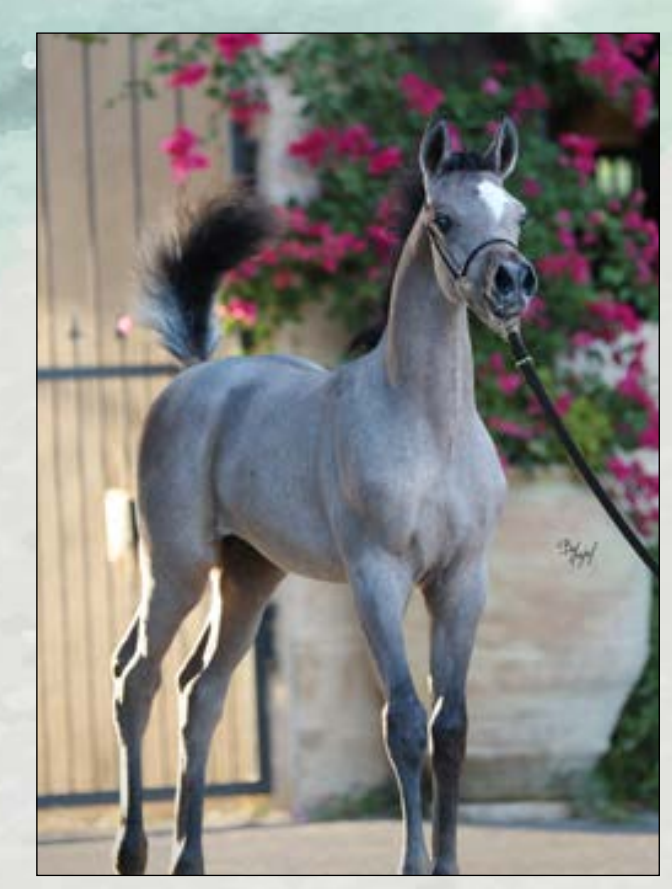
Sanaa AA (Al Ayal AA x Safiyyah AA by Laheeb). Photo by Bar Hajaj