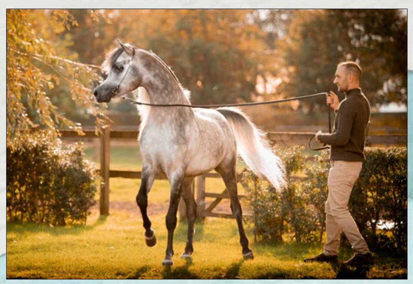
2019 World Champion Junior Colt EKS Farajj. Strongly linebred to Laheeb.