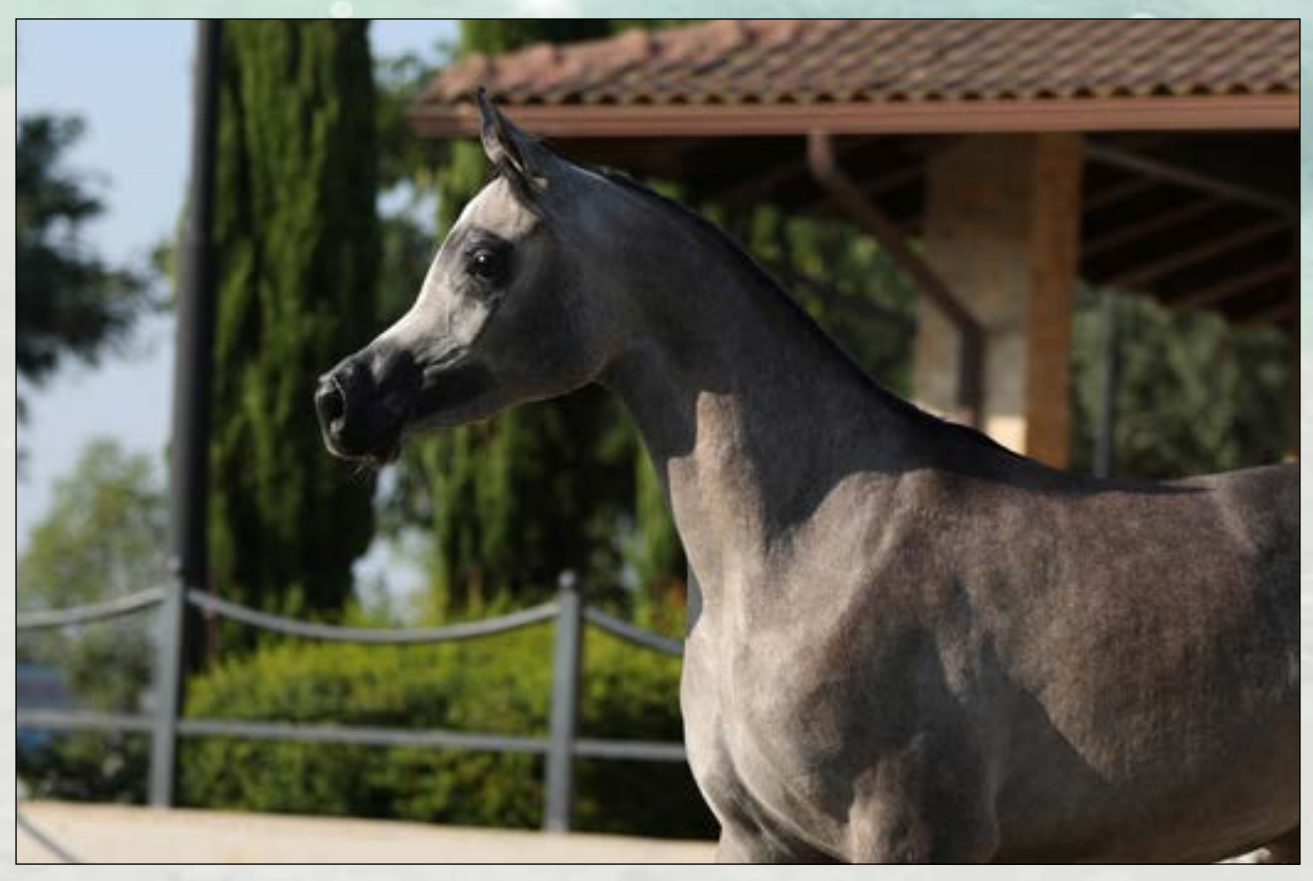
Bahiya AA (Kenz Al Baydaa x Balqis AA by Laheeb).