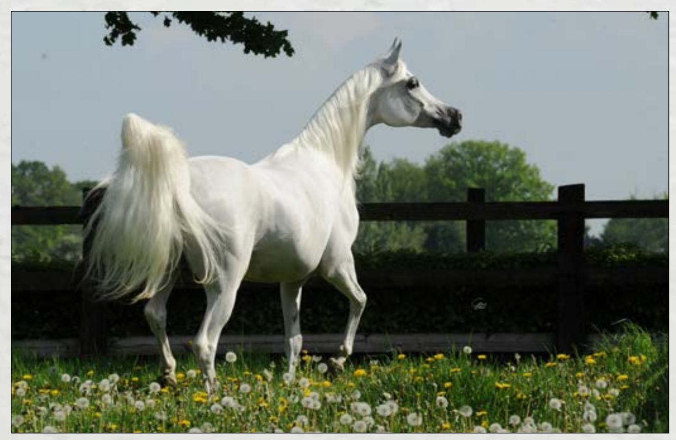
Multi-Champion and 2014 Bronze World Champion Mare Emira (Laheeb x Embra).