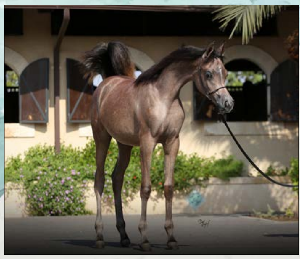
Sarai AA (Jyar Meia Lua x Safiyyah AA by Laheeb).