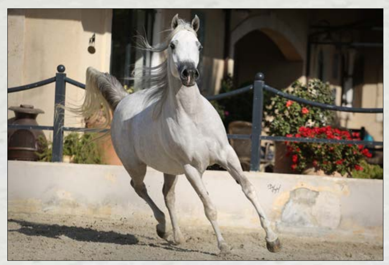
Nefertiti AA (Laheeb x Nashwah AA).