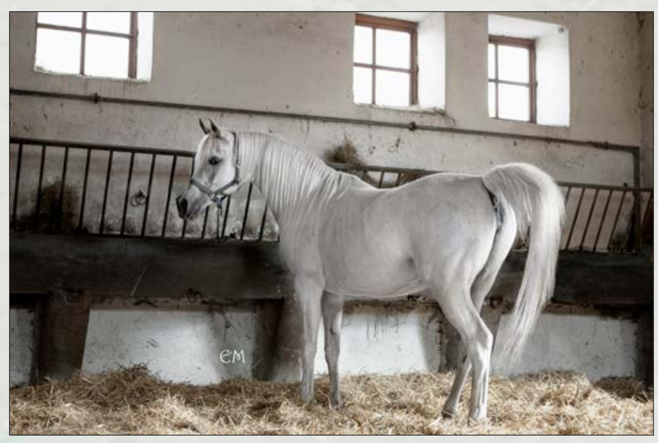
2005 Polish National Champion and World Champion Mare. Galilea (Laheeb x Georgia).