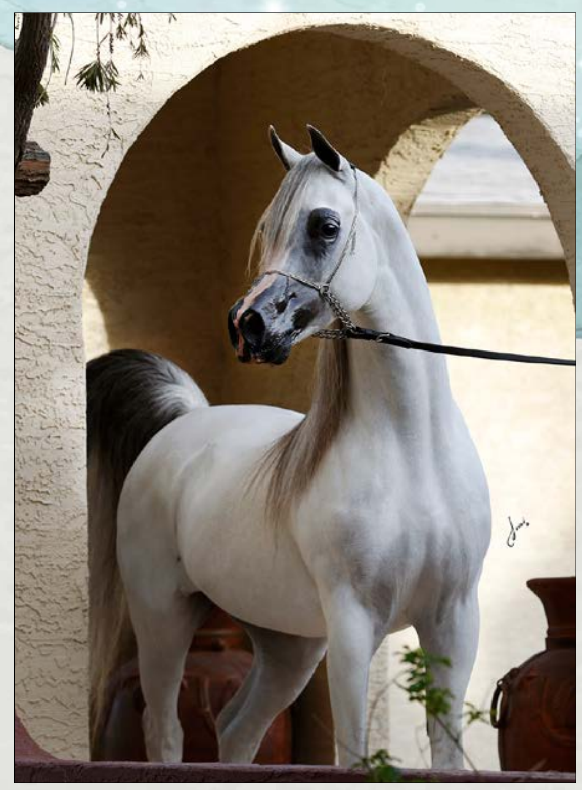
Multi Champion Stallion Baha AA (Al Ayad x Baraaqa AA by Laheeb).