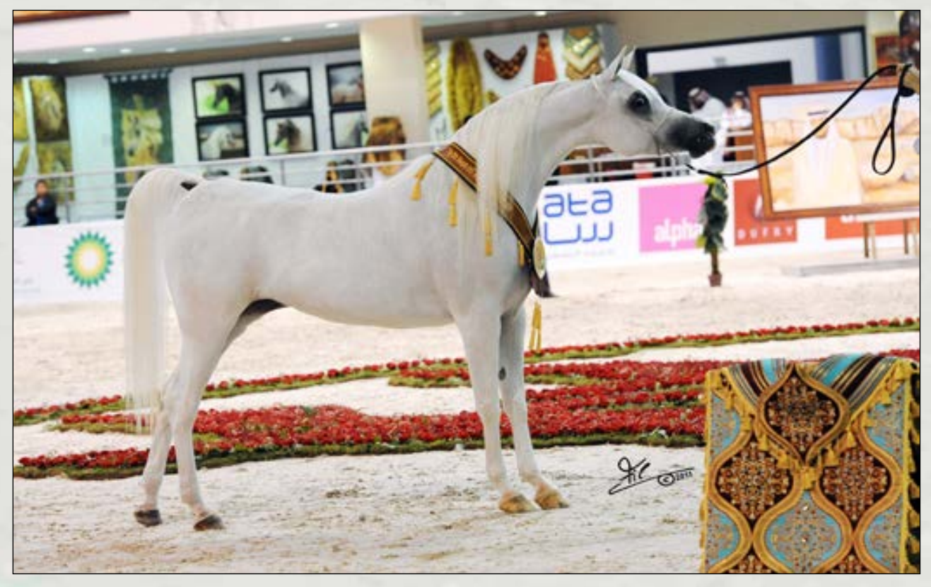
Badawiyeh AA (Laheeb x Bahiha) Multi-Champion Mare and 2014 Silver World Champion Mare.