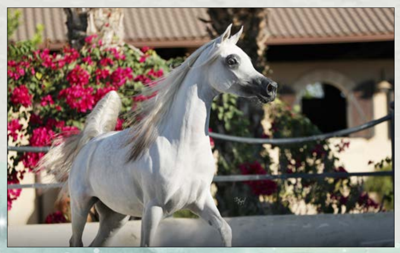
Malikat AA (Kenz Al Baydaa x Malikah AA by Laheeb).