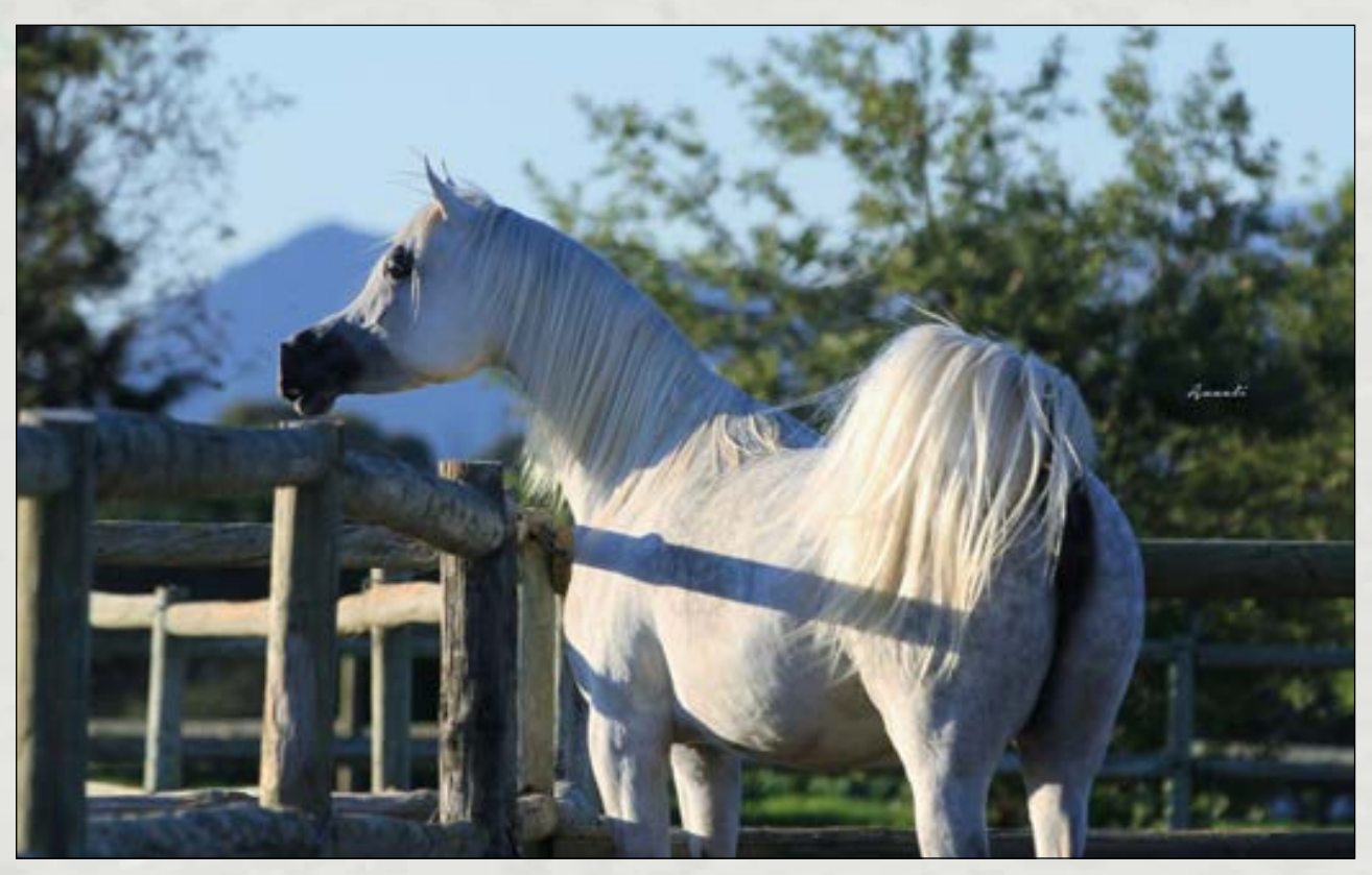
EKS Bint Helwah (Laheeb x Bint Helwah<sup>AA</sup> (Al Ayad x Al Halah<sup>AA</sup> by Laheeb) Dam of World Champion EKS Farajj.