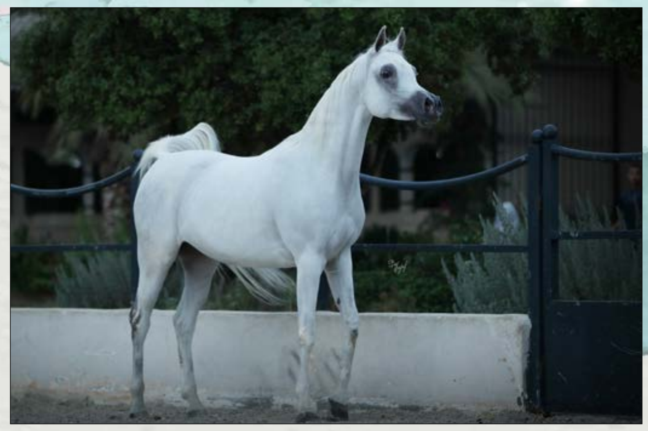
One of the most important Laheeb daughters at Ariela Arabians, Safiyyah ^{AA} (Laheeb x Saniyyah RCA). Five of her daughters have been retained for the Ariela program.