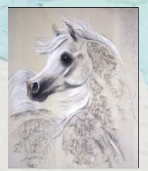
Laheeb's paiting from Poland