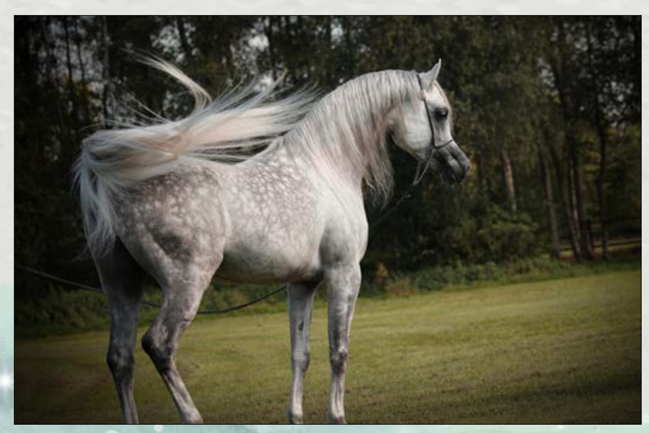
Reserve Champion Colt at the Israeli Egyptian Event, Al Wahab AA (Laheeb x The Vision HG).