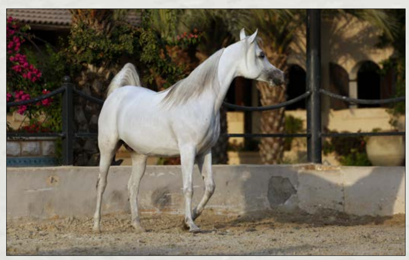
Multi Champion Mare Basmah AA (Laheeb x Al Baraqai AA).