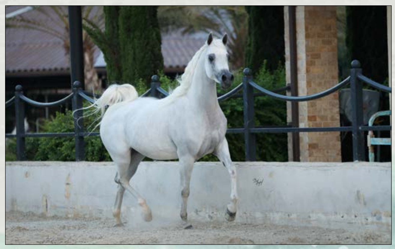
Nile Maha AA (Ansata Nile Pharaoh x Malikah AA by Laheeb).