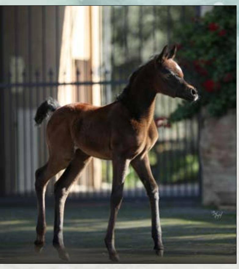
Sara AA (Emerald J x Safiyyah AA by Laheeb).